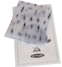
Protective Lens Kit & Operating Guide