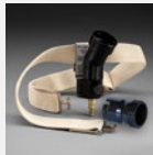
V-300/37019 Valve Assembly ††