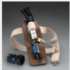
V-200 Vortemp™ Heating Assembly ††