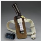
V-100/37018 Vortex Cooling Assembly ††