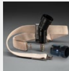
V-400/37020 Low-Pressure Assembly ††