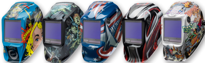
Jessi vs. The Robot™ K3372-4