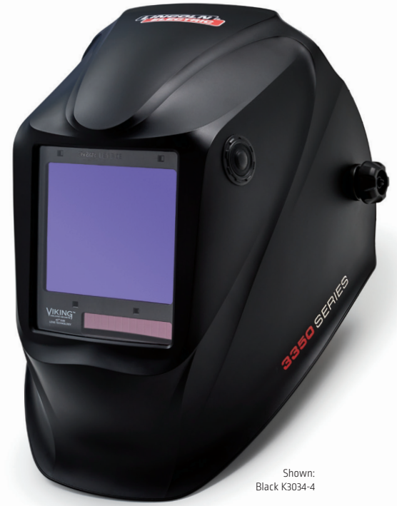
Shown: Black K3034-4