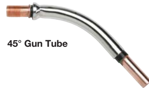
45° Gun Tube