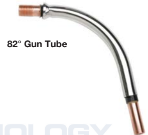
82° Gun Tube

WELDING TECHNOLOGY SUPPLIERS OF WELDING AND ENGINEERING EQUIPMENT