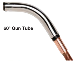
60° Gun Tube