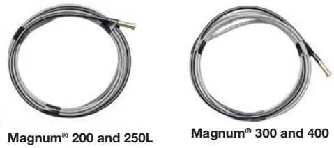
Magnum® 200 and 250L