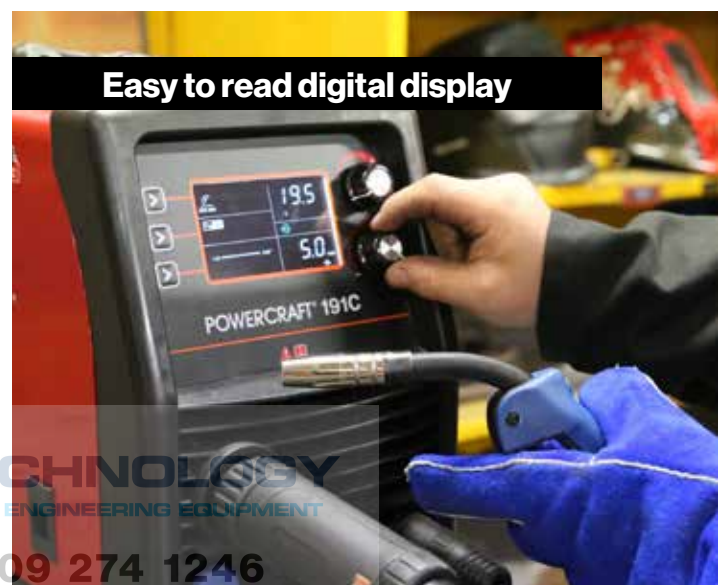
Easy to read digital display

WELDING TECHNOLOGY SUPPLIERS OF WELDING AND ENGINEERING EQUIPMENT