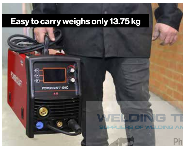
Easy to carry weighs only 13.75 kg