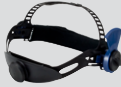
70 50 15