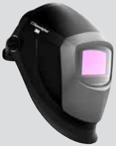
40 13 85