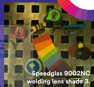
Speedglas 9002NC welding lens shade 3.