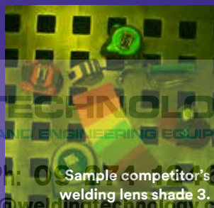
Sample competitor's welding lens shade 3.