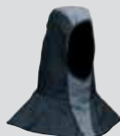
16 91 00