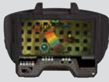
40 00 85