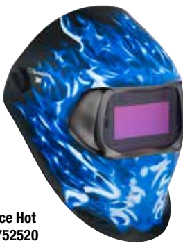
Ice Hot 752520