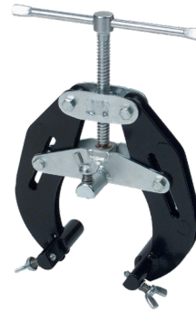
2-6" ULTRA™ Clamp