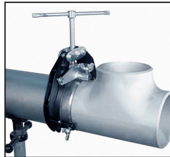
Pipe to tee