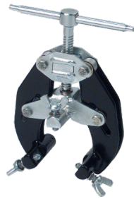
1-2.5" ULTRA™ Clamp