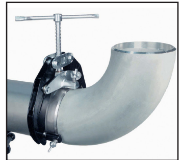
Pipe to fitting