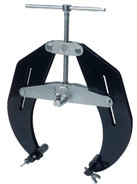
5-12" ULTRA™ Clamp